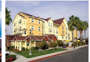
TownePlace Suites Newark, CA