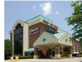
Drury Inn & Suites Norcross, GA